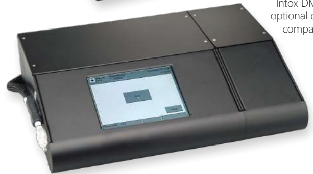
Intox DMT with optional dry gas compartment